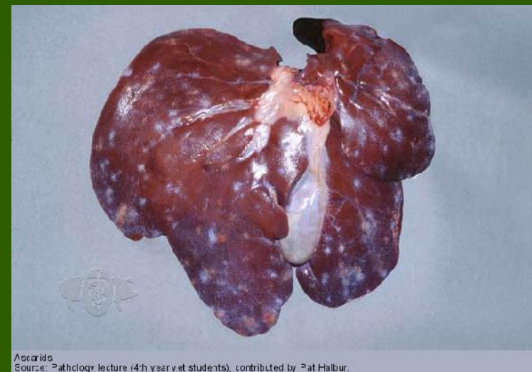
Ascarids